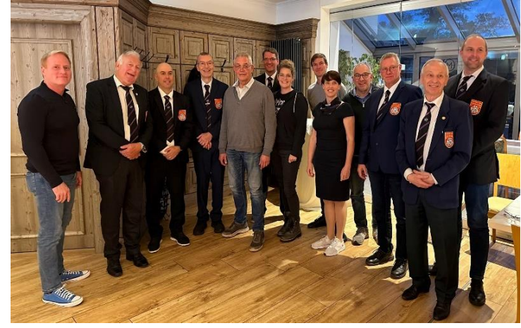
Board members, extended board and guests

In the subsequent meeting of the country representatives, important topics for the further development of the TGTSDA were discussed and the course for the coming years was set in order to enable the responsible members and functionaries to